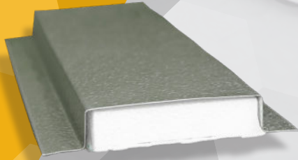
Hat Channel Batten