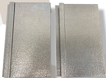
Front Facing with J-Trim Secured