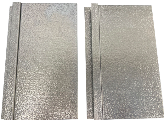
Front Facing with J-Trim Secured