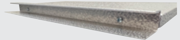
J-Trim Secured to Panel