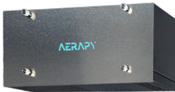
Everidge UV Pro

Regular walk-in coolers face constant threats from mold, viruses, bacteria, and allergens which lead to food waste and food safety issues...Let's fix that! Combine the power of three Everidge cutting edge technologies to ensure the highest standards of hygiene and durability in your cold storage.