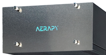
Everidge UV Pro

Regular walk-in coolers face constant threats from mold, viruses, bacteria, and allergens which lead to food waste and food safety issues...Let's fix that! Combine the power of three Everidge cutting edge technologies to ensure the highest standards of hygiene and durability in your cold storage.